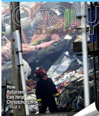
How Rotarians can help Christchurch PAGE 9