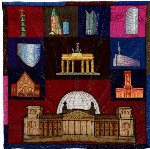
BERLIN 50 x 50 cm (stitched in free motion)