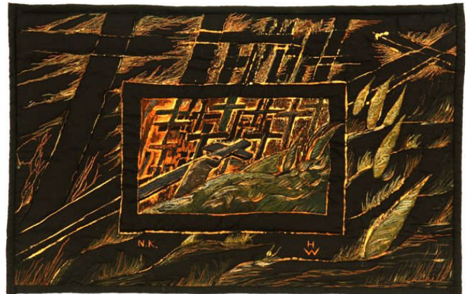
KOSOVO 75 x 50 cm (cotton burned out with Chlor, painted with silk- paints stitched in free-motion machine technique.